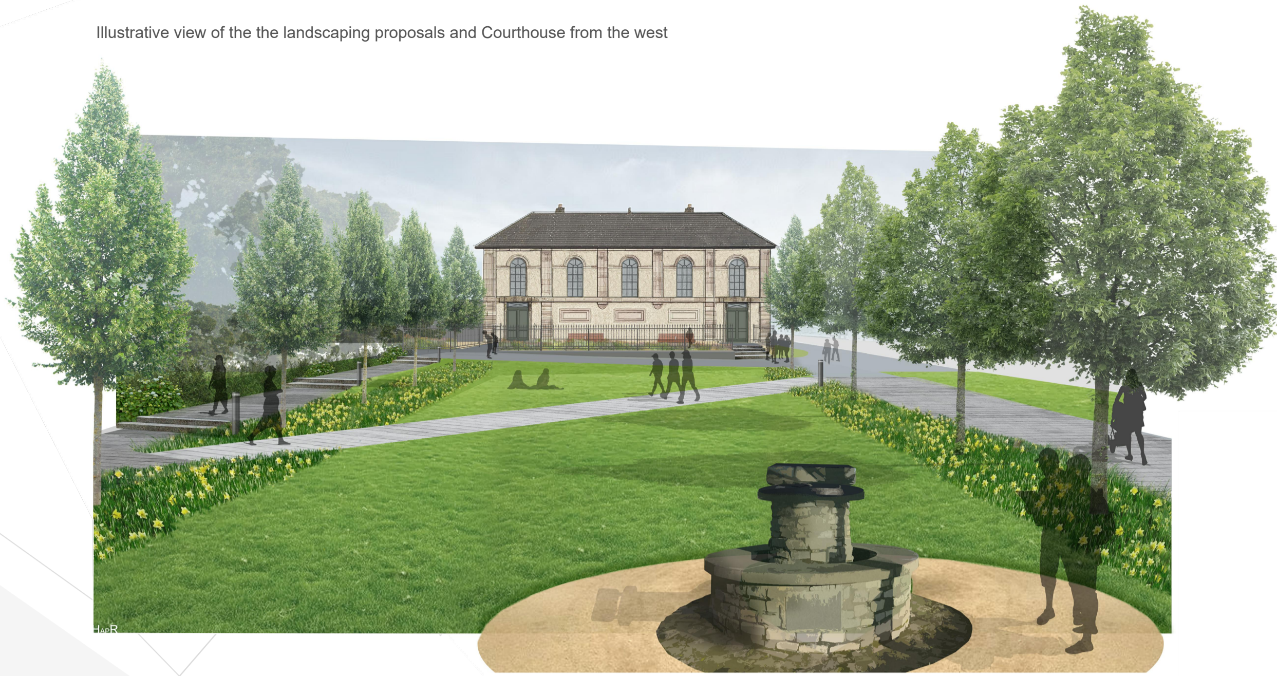
Illustrative view of the the landscaping proposals and Courthouse from the west