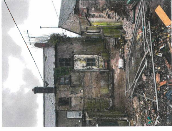
View A. Rear of Proposed Unit 3