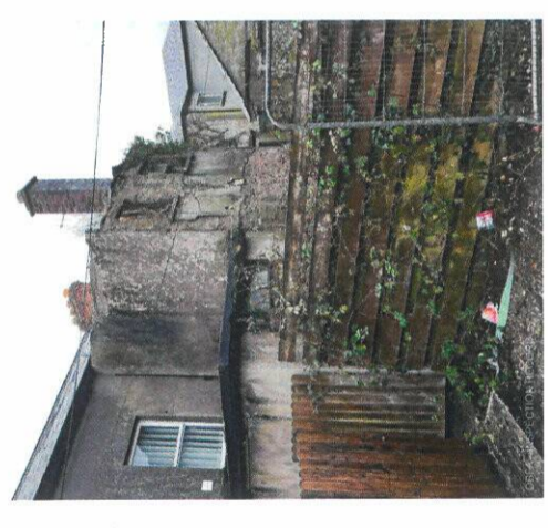
View C. Derelict Lean-to and stores to be demolished.