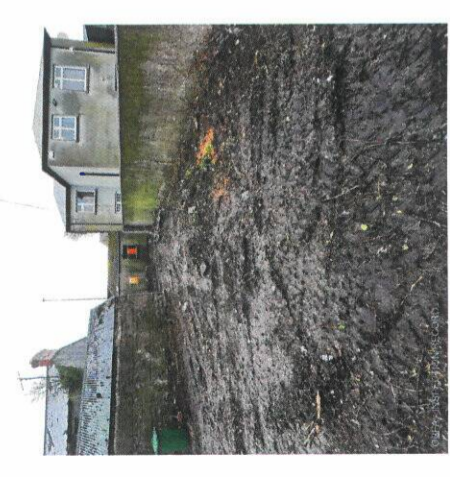
View B. Showing South Boundary condition