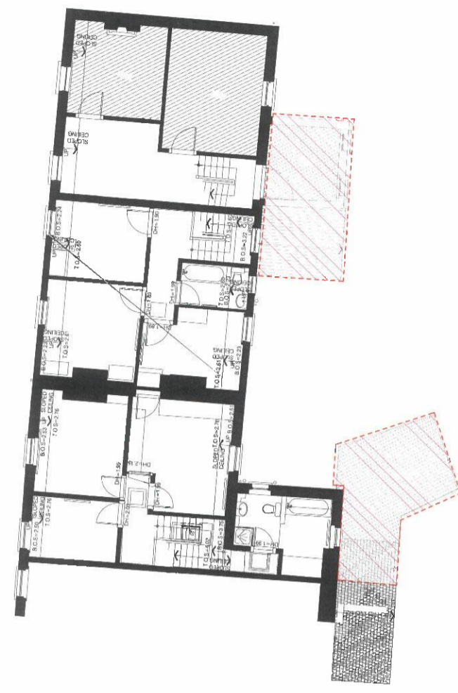
5 Existing 01 1st Floor Level 1:100