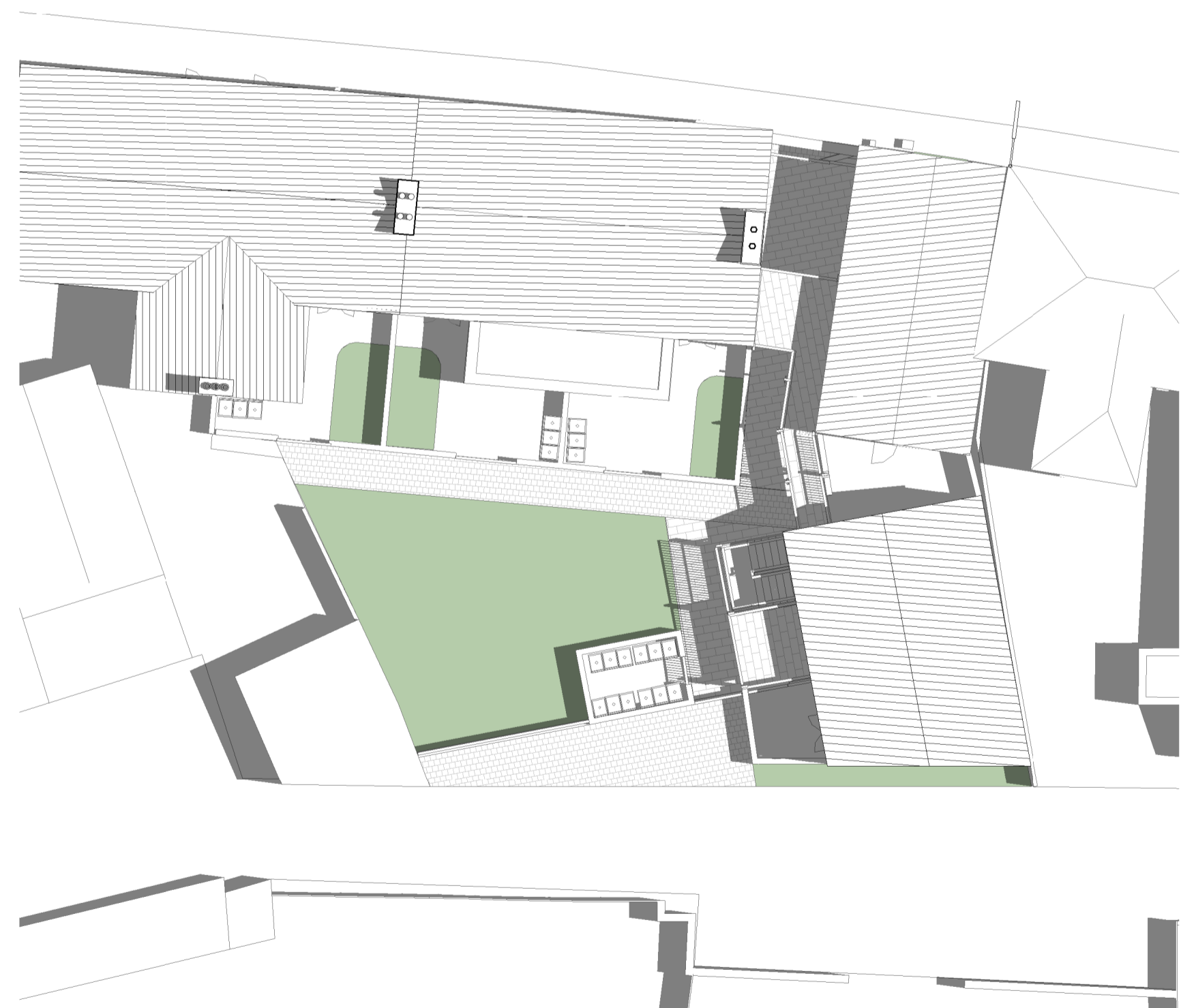
3 Sunpath Diagram 21st June 12.00pm