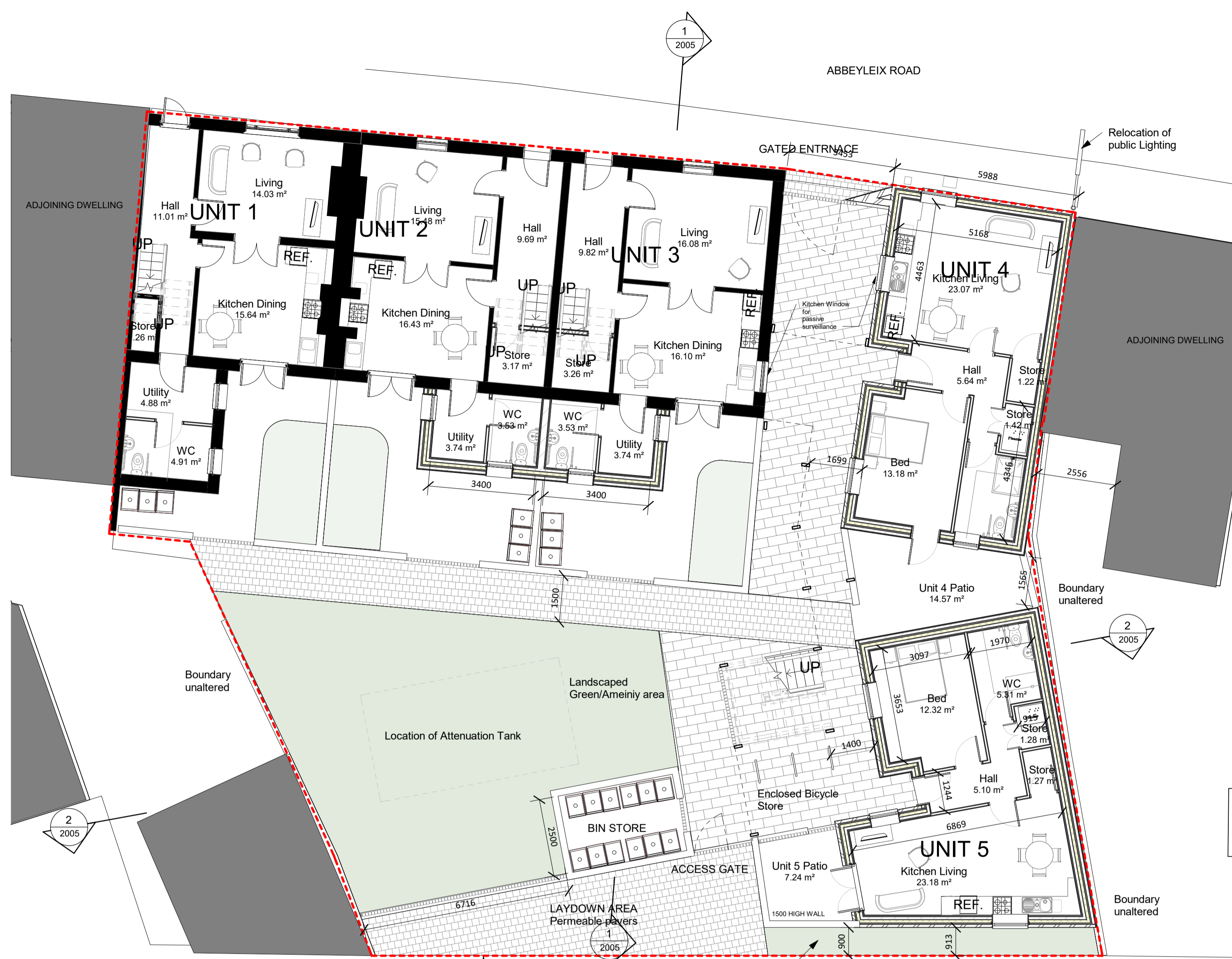
GA_01 GROUND FLOOR PLAN