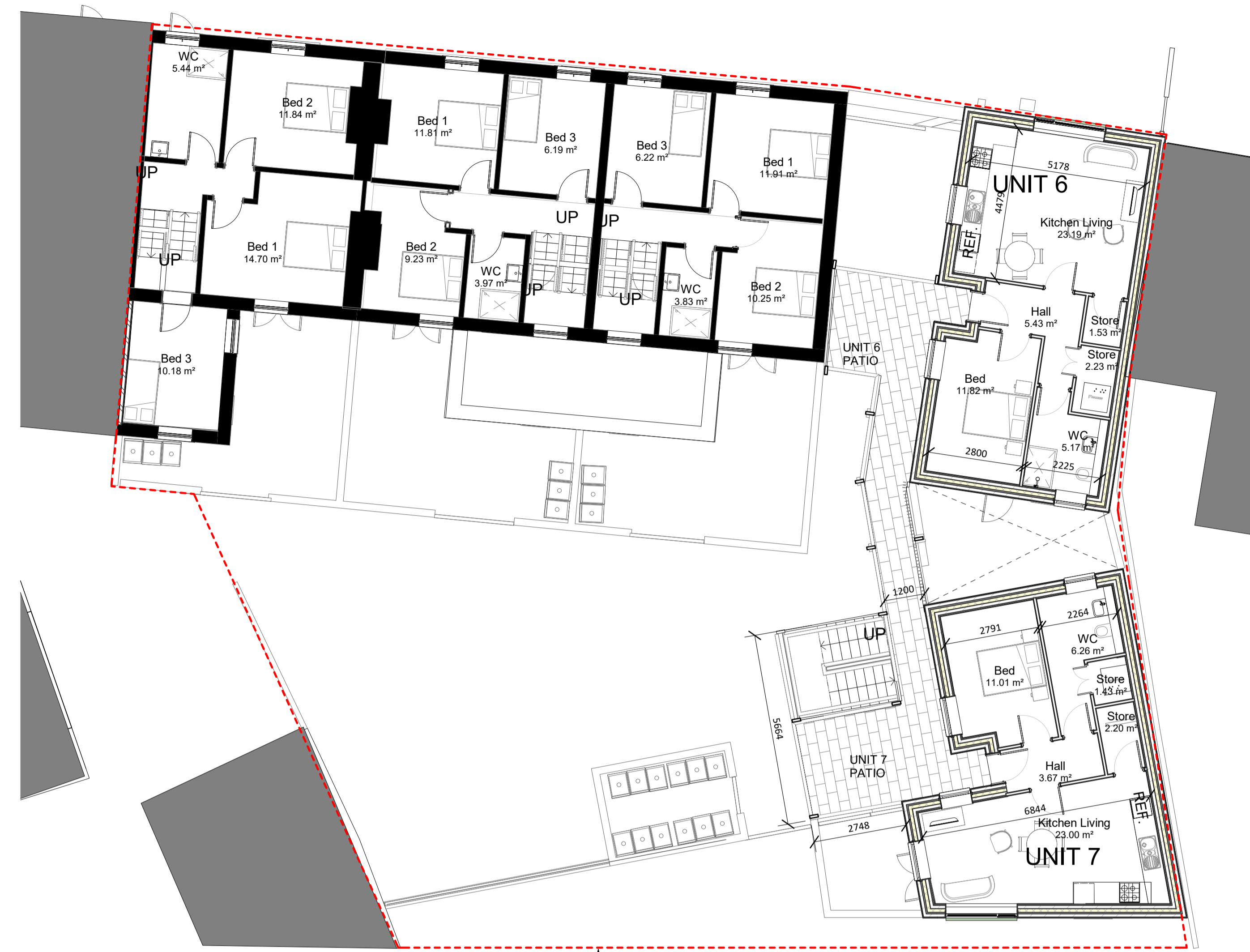
GA_02 FIRST FLOOR PLAN