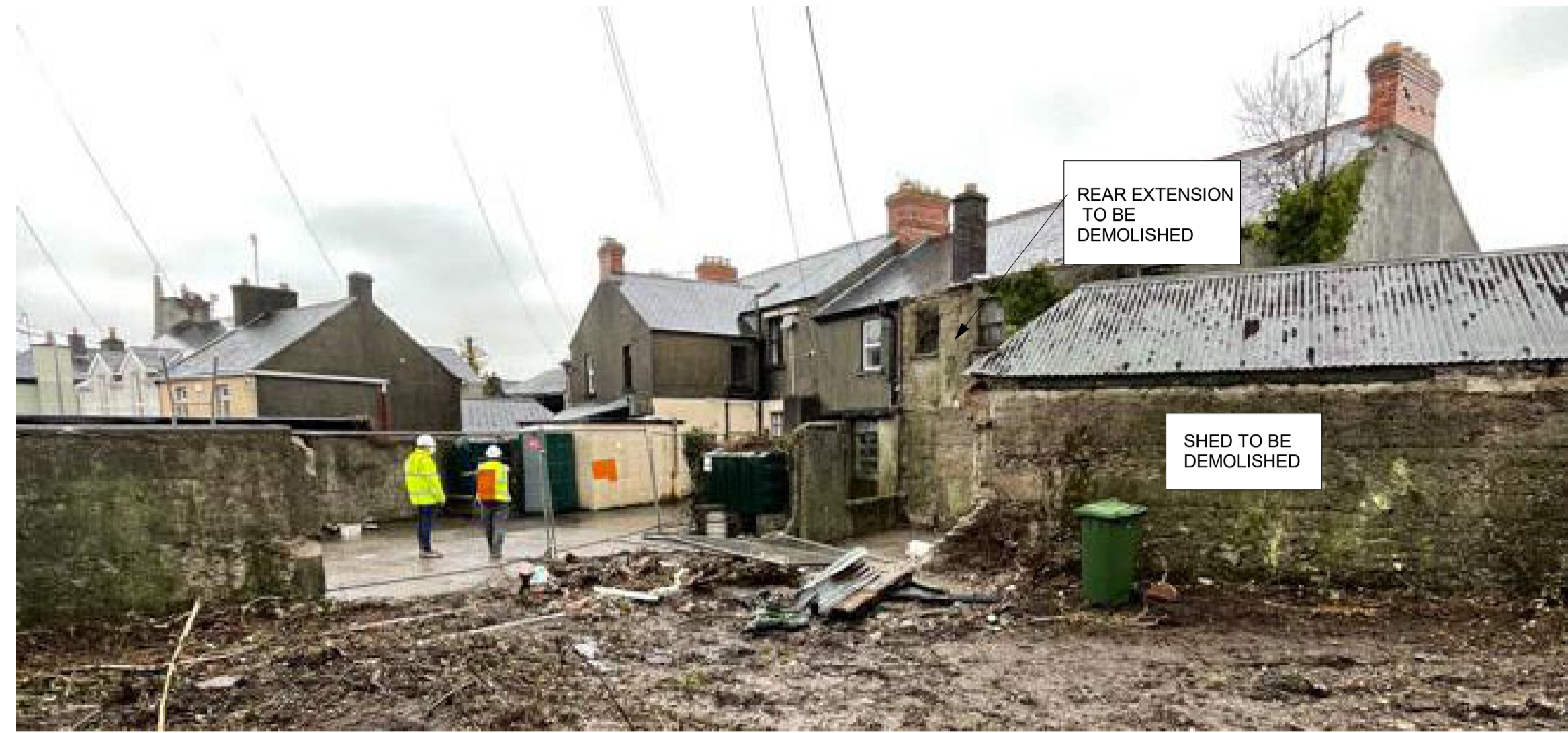
Rear of Existing Terrace