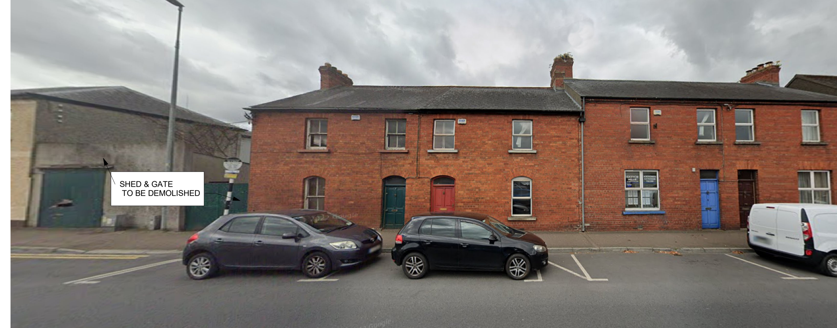
Existing Terrace from Abbeylax Road