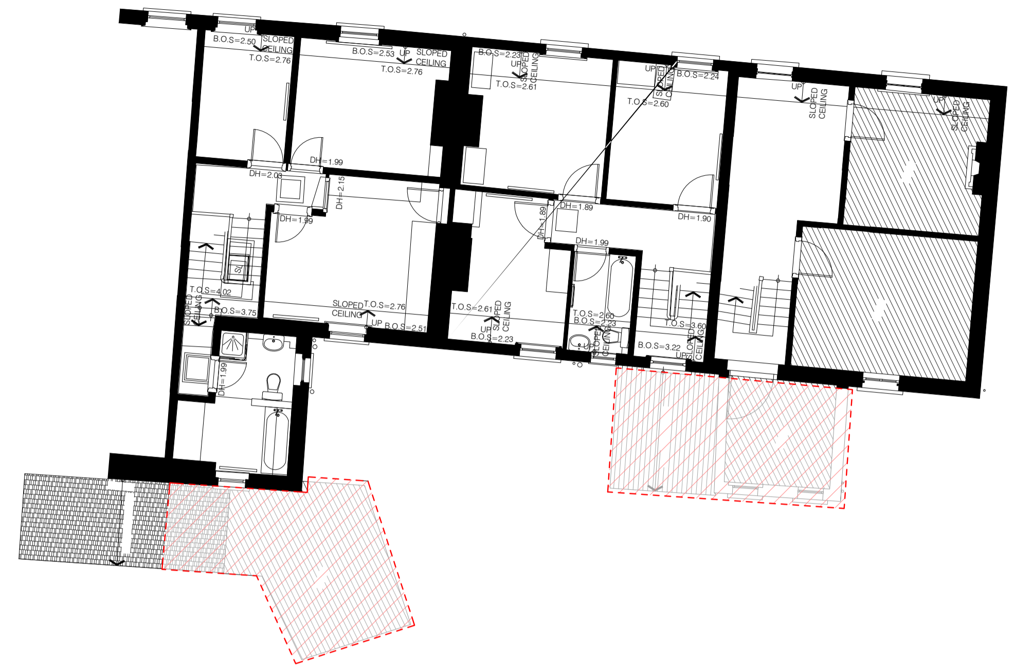
5 Existing_01_1st Floor Level 1:100