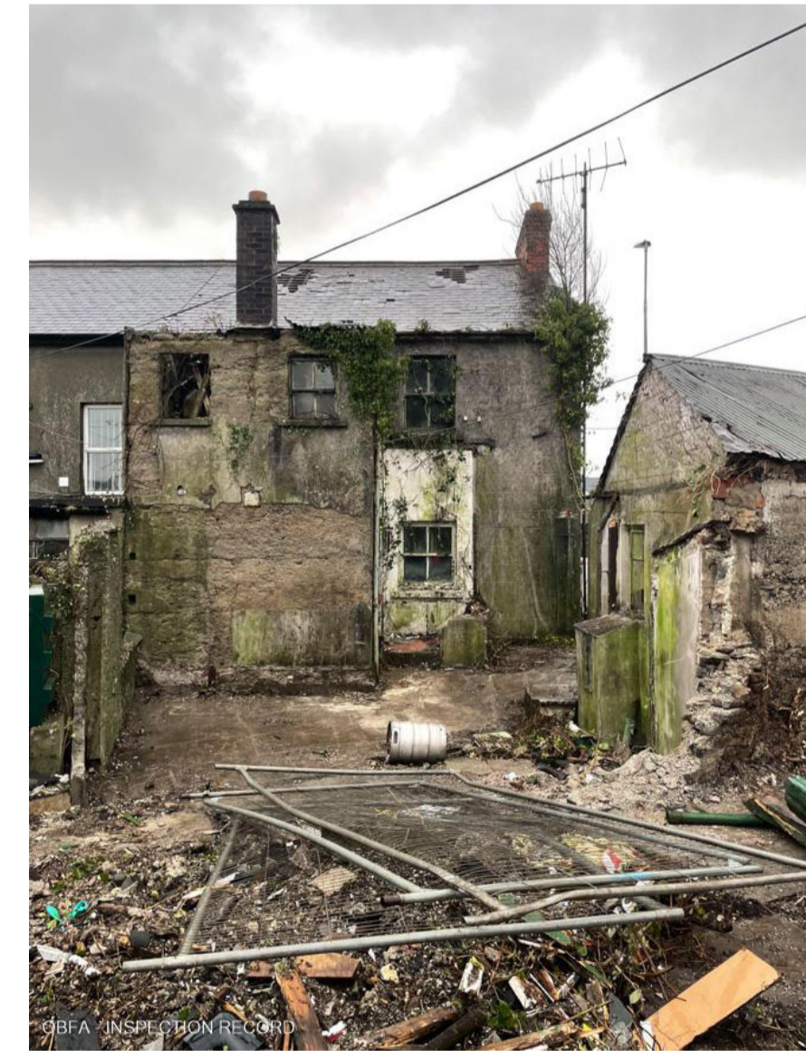
View A. Rear of Proposed Unit 3