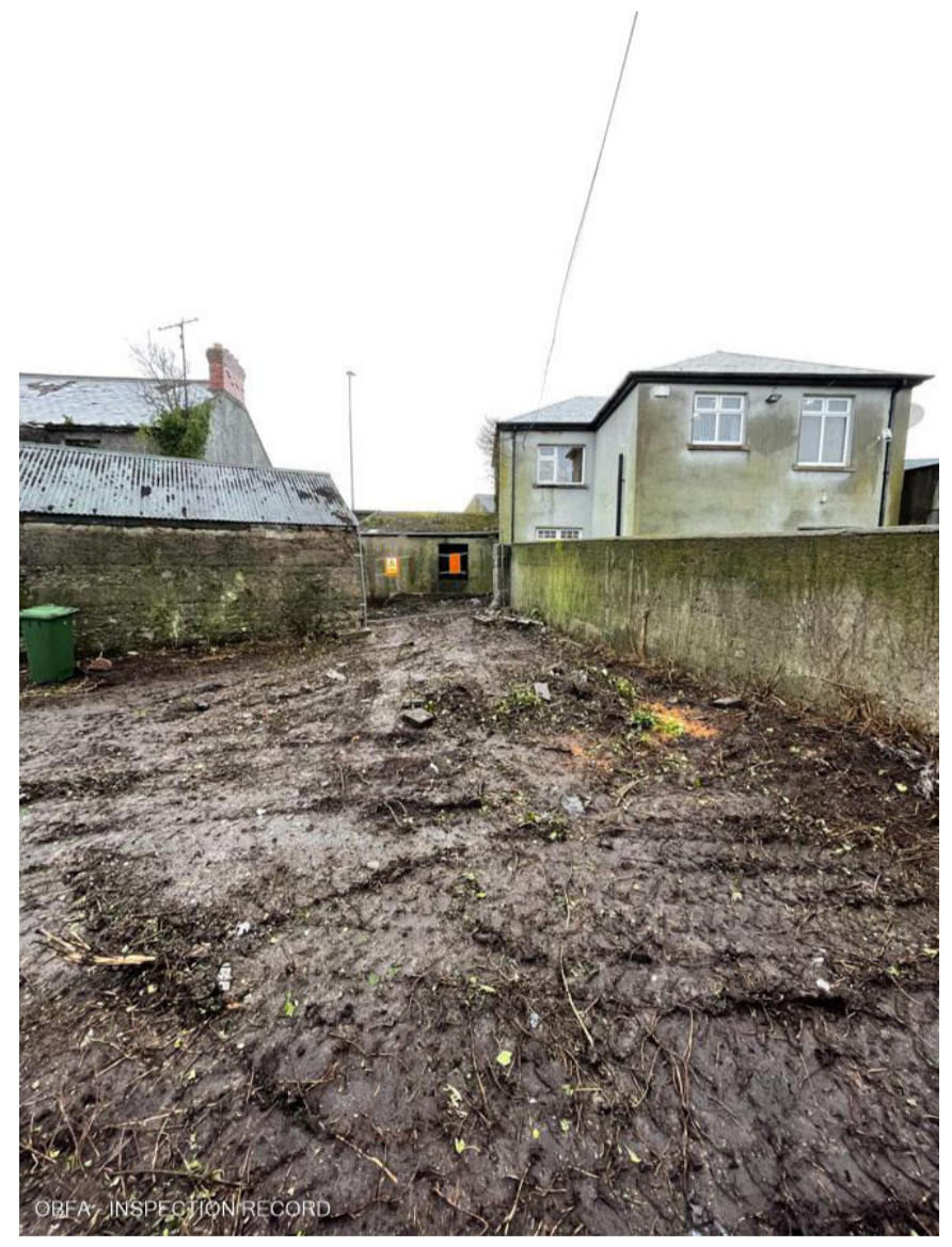
View B. Showing South Boundary condition