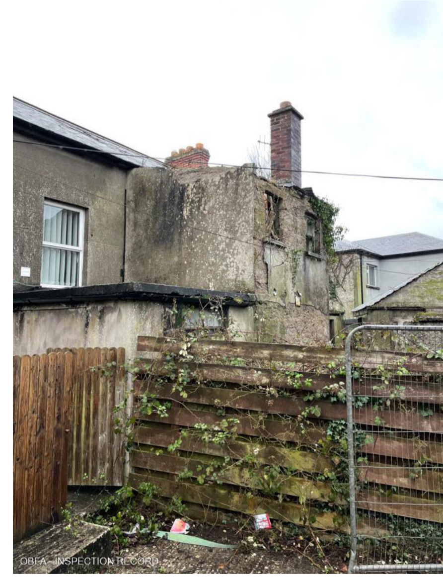
View C. Derelict Lean-to and stores to be demolished.