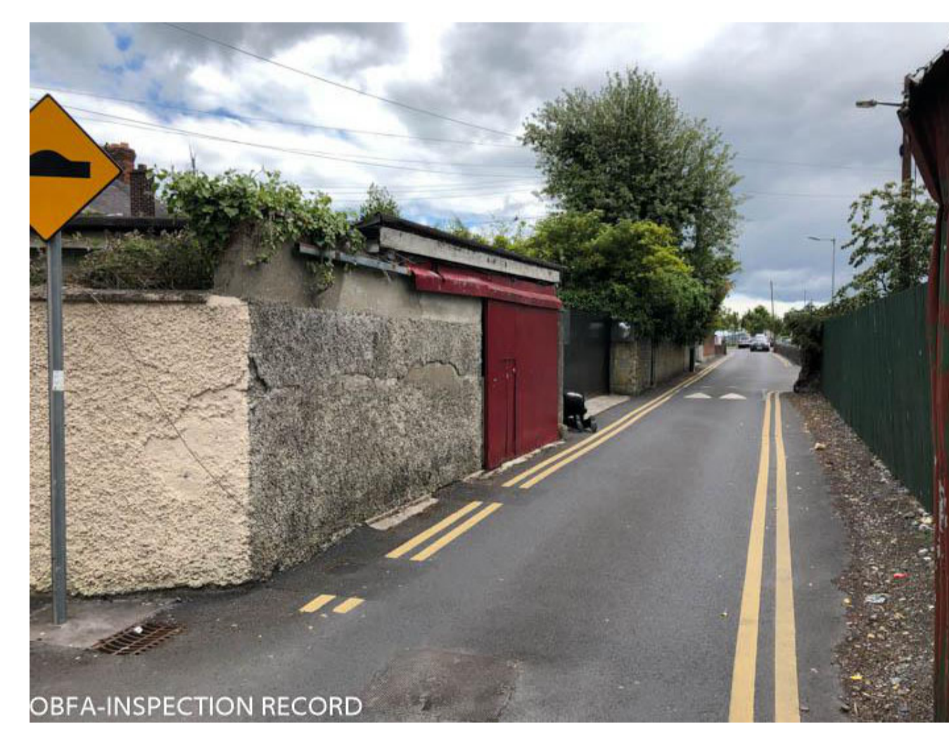
Rear boundary. VIEW C