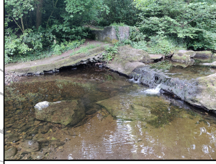
Weir of Potential Industrial Heritage