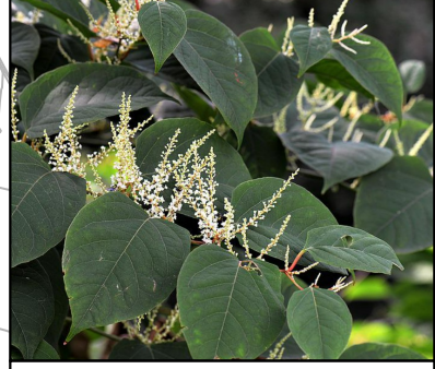
Japanese Knotweed (IAPS)