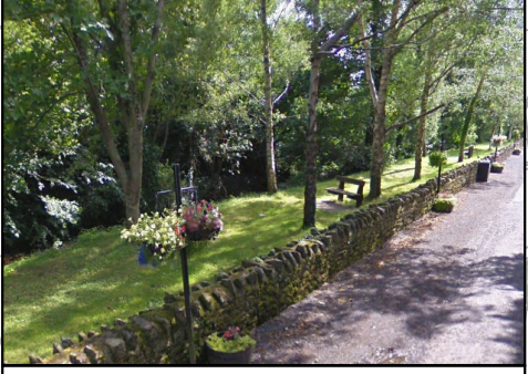
Maintain Village Aesthetics