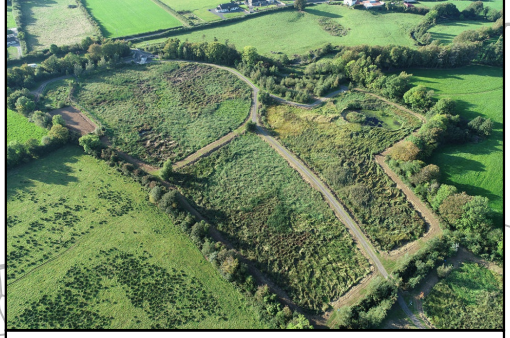
Integrated Constructed Wetlands