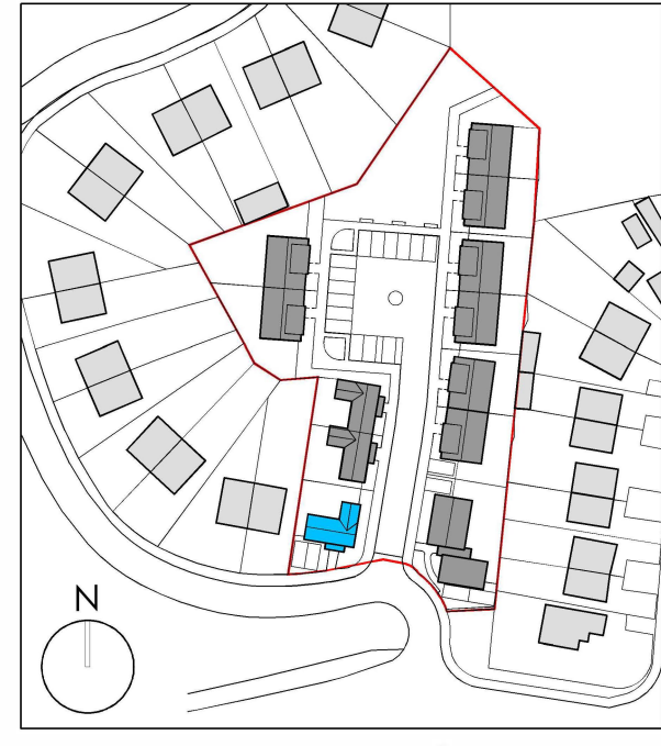
KEY PLAN (NTS) TYPE A HIGHLIGHTED IN BLUE

All boundary treatments, hard landscape surfaces and street furniture are subject to modification to materials, type and height in accordance with availability of material and cost plan considerations.