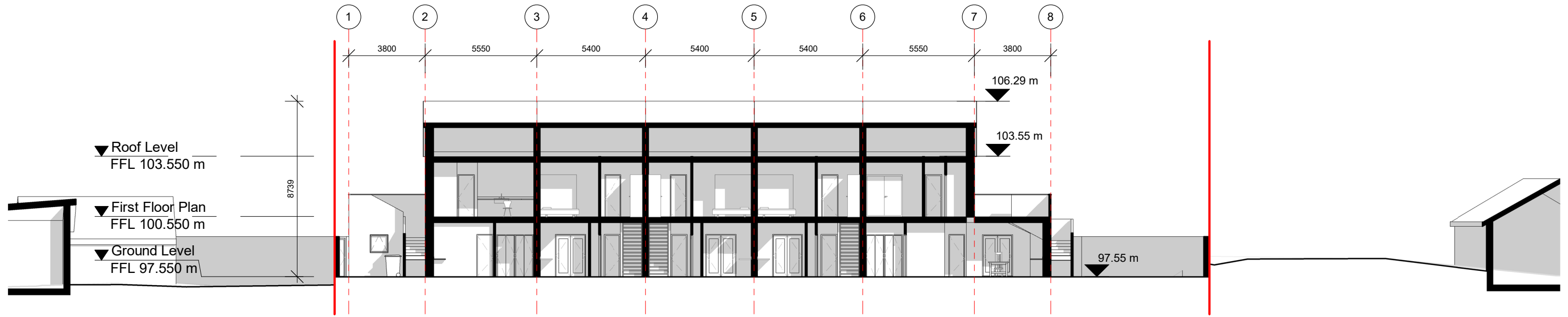
1 LONGITUDINAL SECTION 1 : 200