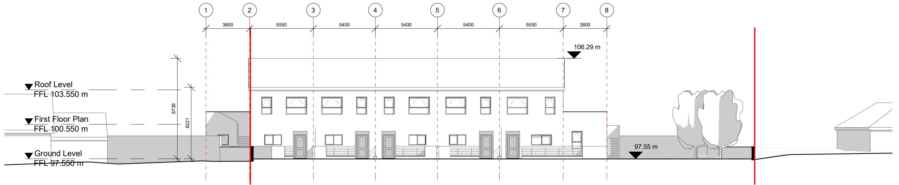
1 FRONT ELEVATION 1 : 200