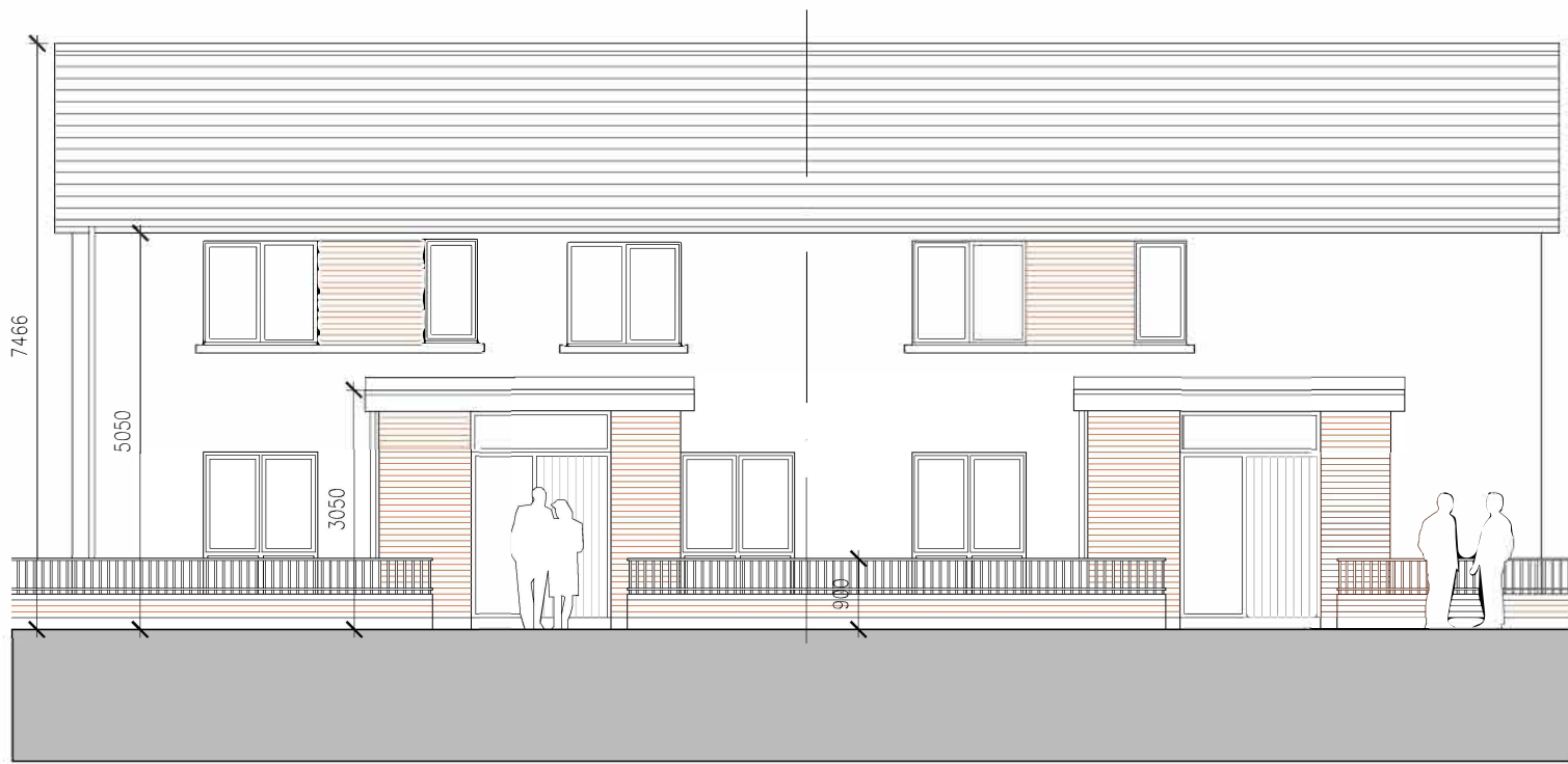
FRONT (EAST) ELEVATION

Eave, parapet and ridge dimensions are subject to minor modification at detailed design. Materials, brick type and colour are subject to modification in accordance with availability of material and cost plan considerations. All boundary treatments, hard landscape surfaces and street furniture are subject to modification to materials, type and height in accordance with availability of material and cost plan considerations.