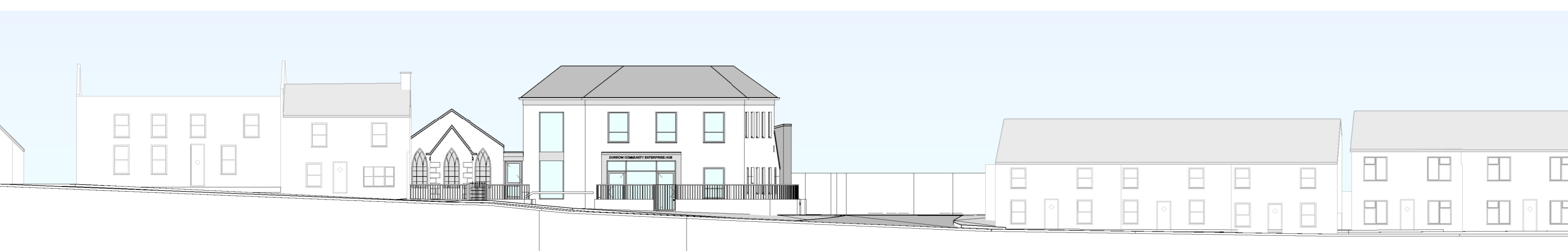
2 Streetscape Copy 1 SCALE: 1 : 200