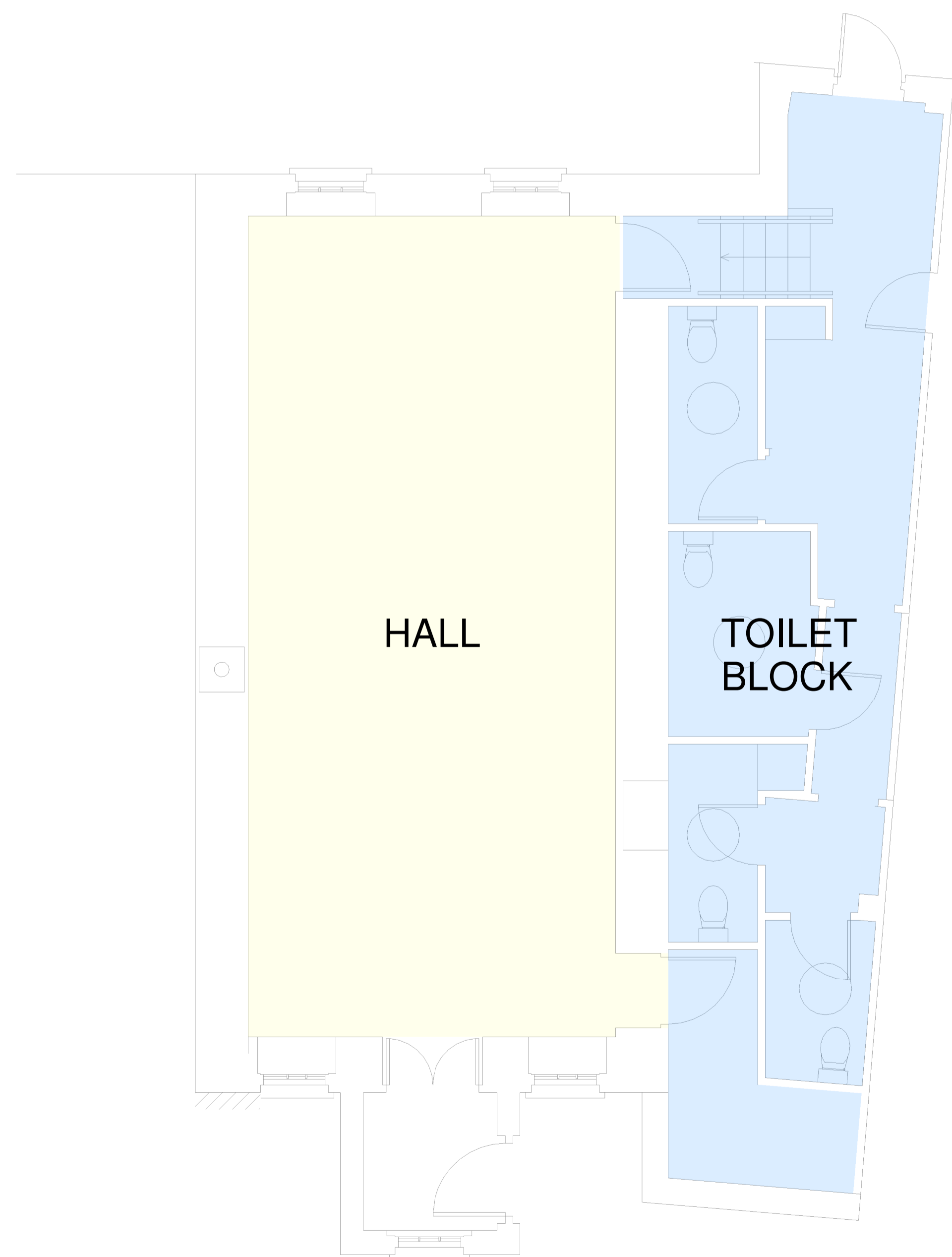
② Floor Plan Existing SCALE: 1 : 50